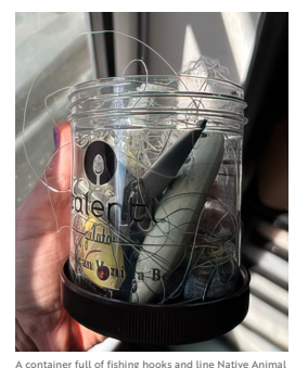
Rescue has pulled out so far in 2023.

Too many situations that could be avoided.