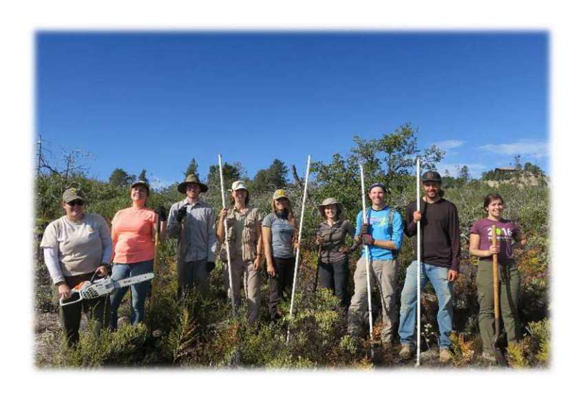
JMc Staff and Interns working with CDFW on a Prior Endangered Species Protection Project